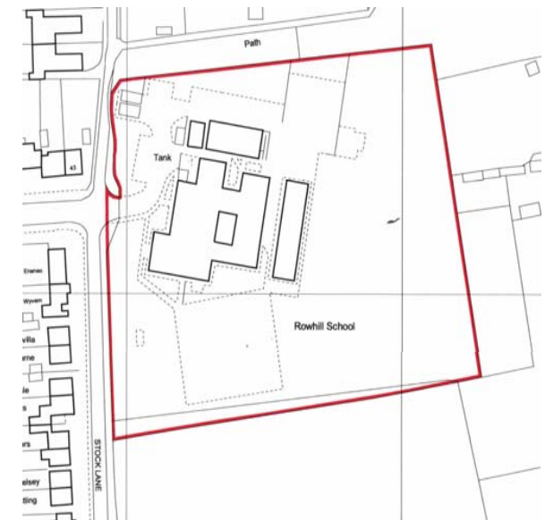
Site Plan of Rowhill